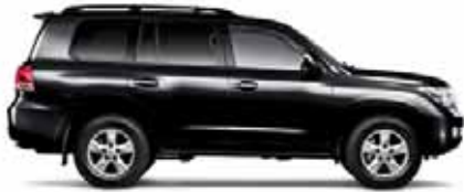
BLACK Dark Gray or Sand Beige interior

Land Cruiser is available in eight exterior colors and two interior colors. But remember, this is one of the world's most legendary off-road vehicles. Which means Land Cruiser also offers a nice dust color, if that's what you're looking for.