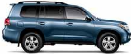
PACIFIC BLUE METALLIC Dark Gray or Sand Beige interior