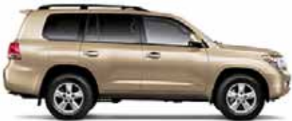
SONORA GOLD PEARL Sand Beige interior