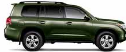
AMAZON GREEN METALLIC Dark Gray or Sand Beige interior