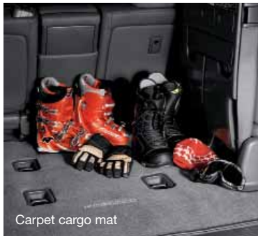
Carpet cargo mat

Genuine Toyota accessories are one good way. They're built to the same exacting standards as the Land Cruiser itself. Even if you don't customize it, though, odds are it will end up feeling like it's yours. After the first few hundred thousand miles or so. Some accessories may not be available in all regions of the country. See your Toyota dealer for details.