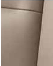
Leather in Sand Beige