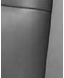
Leather in Dark Gray