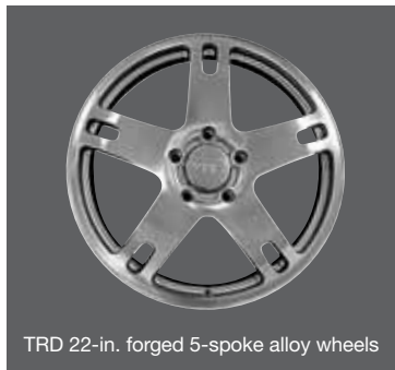
TRD 22-in. forged 5-spoke alloy wheels