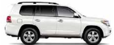
SUPER WHITE Dark Gray or Sand Beige interior