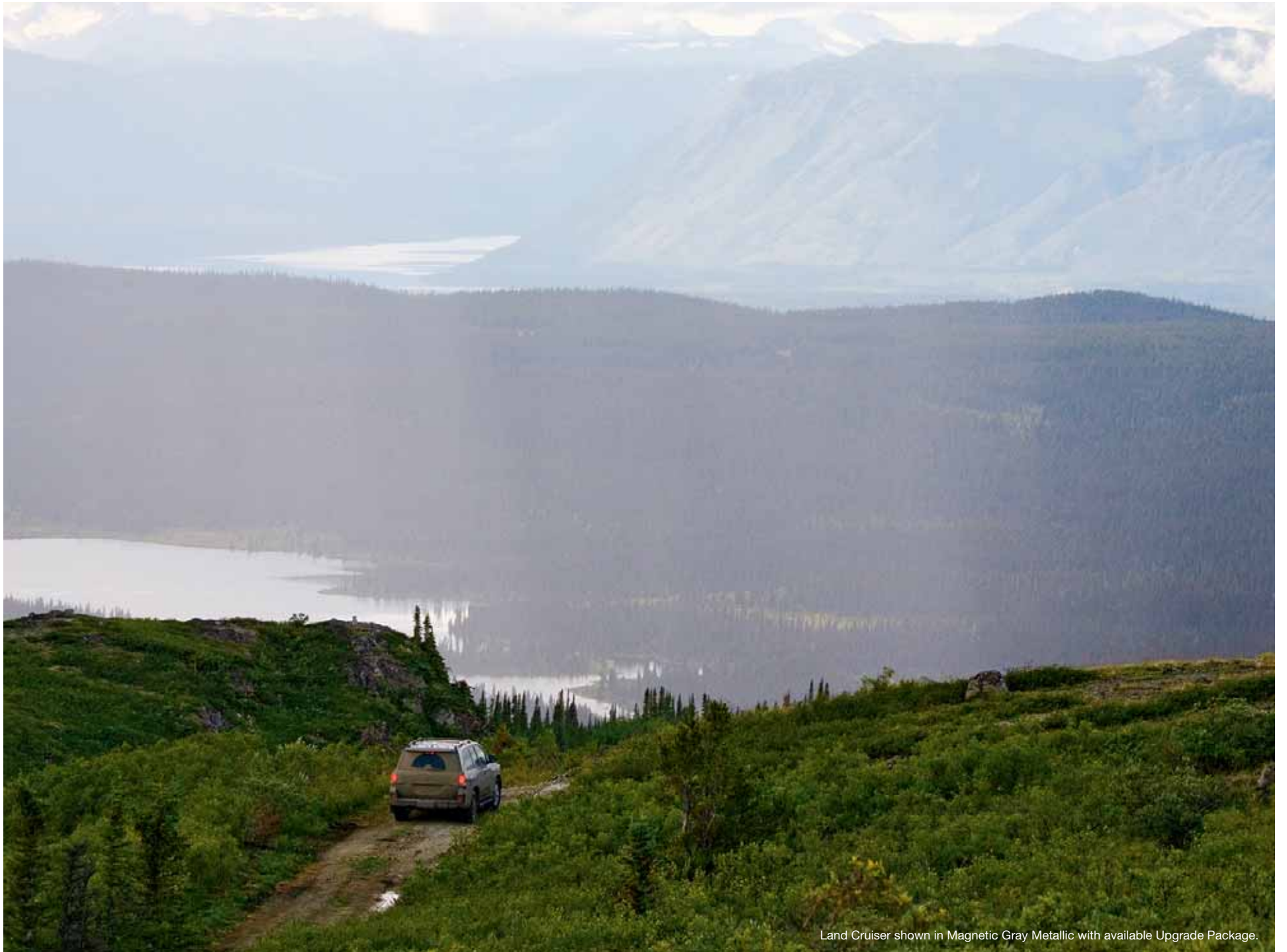
Land Cruiser shown in Magnetic Gray Metallic with available Upgrade Package.