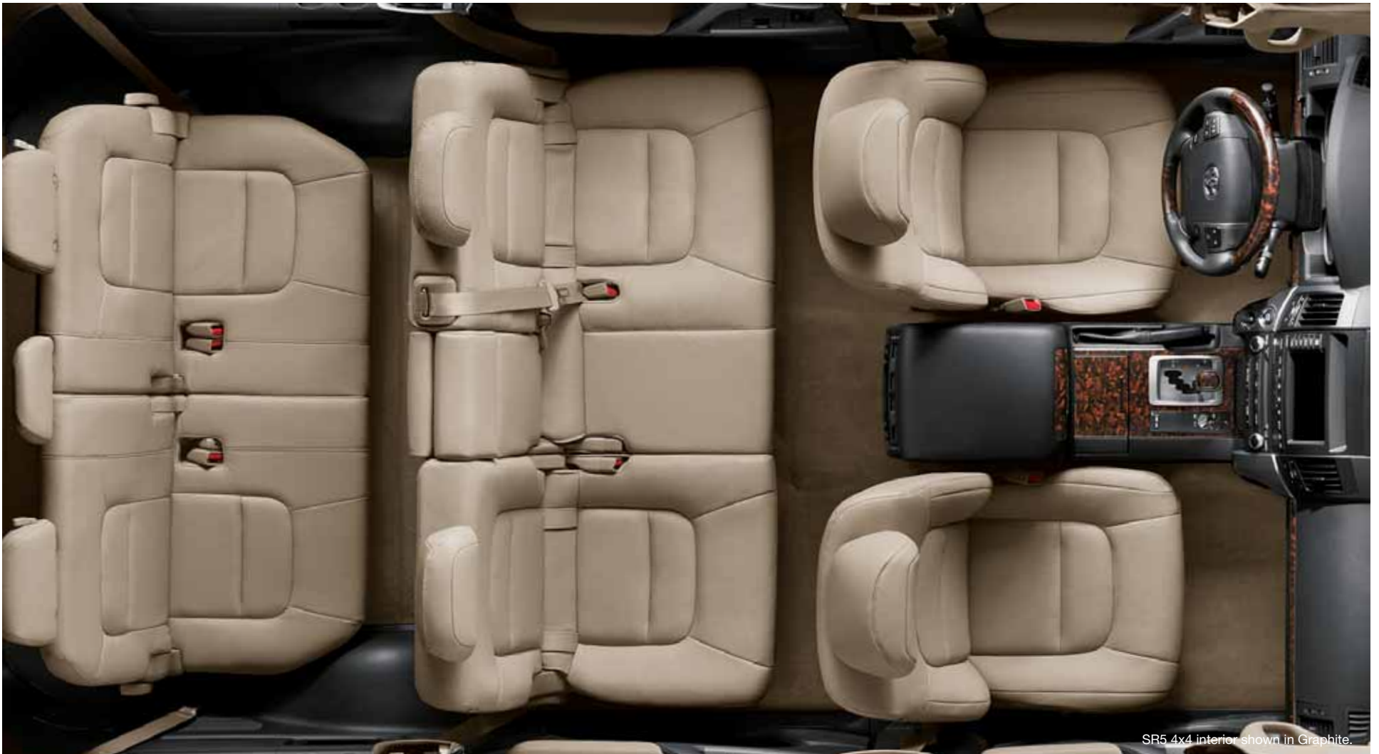
SR5 4x4 interior shown in Graphite.

ENDLESS VERSATILITY The leather-trimmed interior features a foldaway third-row seat, taking the overall seating capacity to eight. But the split/fold design of the second and third rows also allows for a huge range of cargo-carrying configurations, topping out at 81.7 cubic feet! Passengers, gear or both — it's up to you.