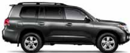
MAGNETIC GRAY METALLIC Dark Gray interior