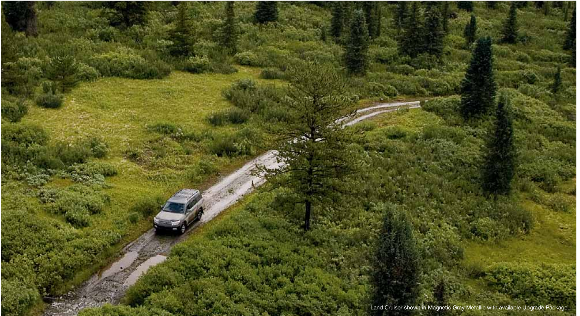
Land Cruiser shown in Magnetic Gray Metallic with available Upgrade Package.

7 It's taken people to the ends of all seven continents. More importantly, it's brought them back. Land Cruiser loyalty comes from the tales owners have returned to tell. Those adventures also reveal a Land Cruiser creed: It's not the one with the most toys who wins. It's the one with the most stories.