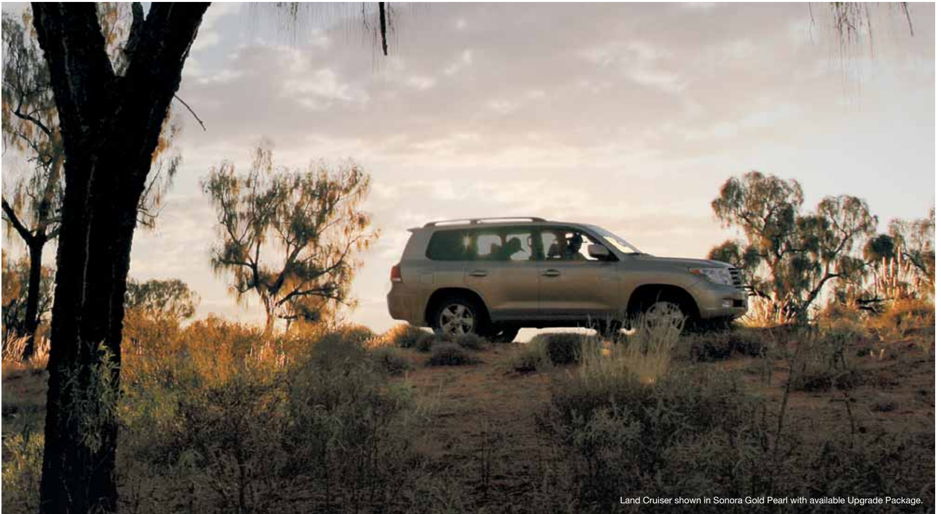
Land Cruiser shown in Sonora Gold Pearl with available Upgrade Package.

The first Land Cruiser set out decades ago. In that time it's traveled to the most remote places on the planet. But it's made an even more important journey as well. It's gone from being Toyota's first 4WD vehicle to an icon of rugged reliability trusted around the globe. That's one path we intend to keep following.