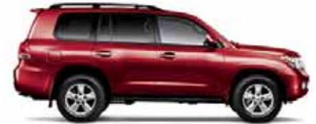
SALSA RED PEARL Dark Gray or Sand Beige interior