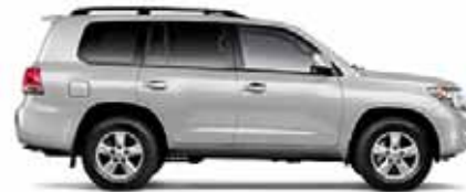
CLASSIC SILVER METALLIC Dark Gray interior