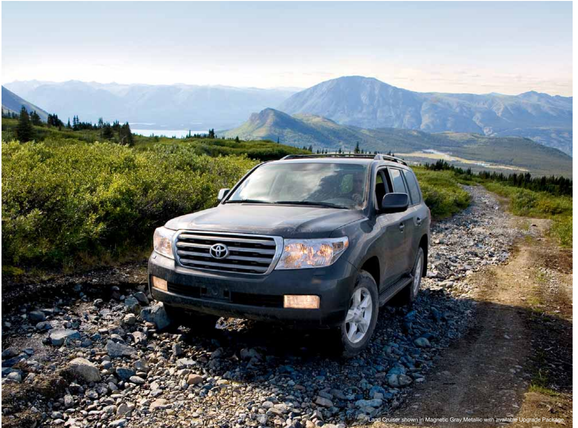
Land Cruiser shown in Magnetic Gray Metallic with available Upgrade Package.