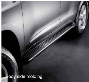
Body side molding