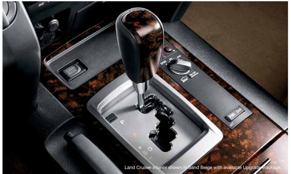
Land Cruiser interior shown in Sand Beige with available Upgrade Package.