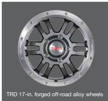
TRD 17-in. forged off-road alloy wheels

All-weather cargo mat Body side moldings Cargo net Cargo tote Carpet cargo mat Carpet floor mats 26 Emergency assistance kit First aid kit Hood protector Paint protection film Remote Engine Starter