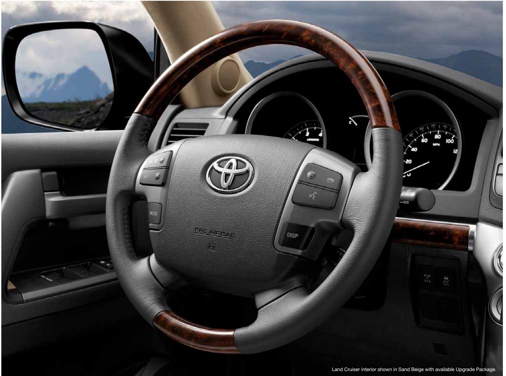
Land Cruiser interior shown in Sand Beige with available Upgrade Package.